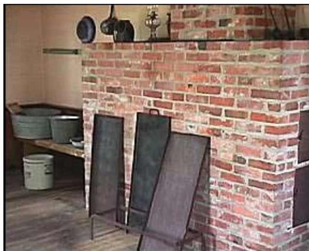
Russian oven in Krause House, photo courtesy of the Mennonite Heritage Museum, Goessel, KS. The metal "zweibach" pans were designed to fit into the long narrow baking chamber. Grass, straw or dried manure served as fuel.